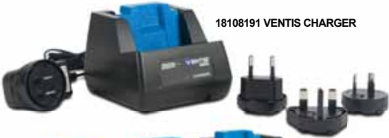
18108191 VENTIS CHARGER