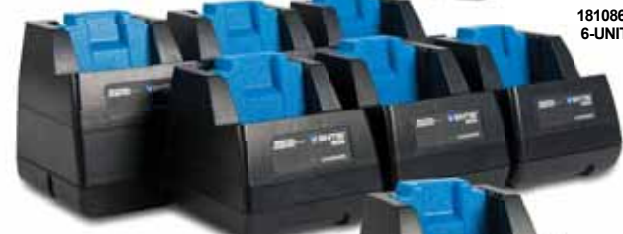
18108650-0 6-UNIT CHARGER