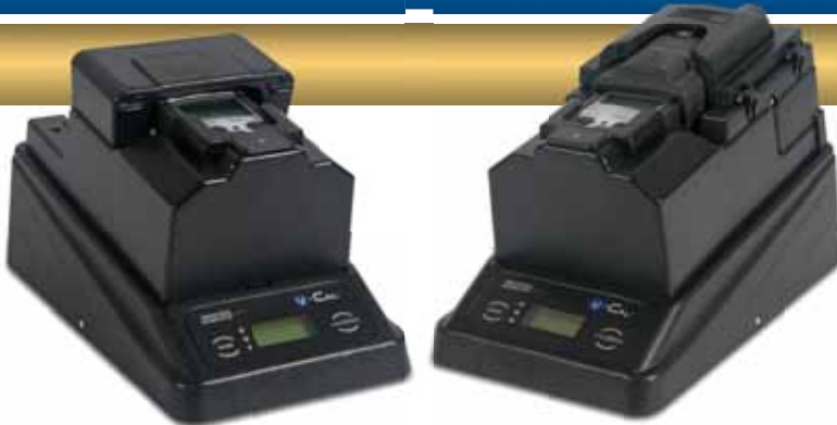
18108631-00 V-CAL WITH VENTIS INSTRUMENT* (*monitor not included)