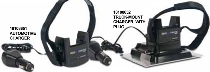
18108652 TRUCK-MOUNT CHARGER, WITH PLUG