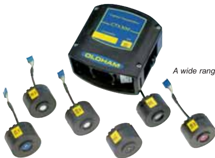
A wide range of sensors*