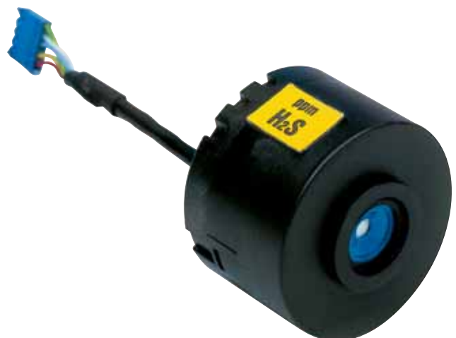
Pre-calibrated sensor for easier maintenance