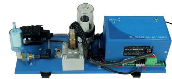
Rapidox 1100Z-OEM-RSB Enclosure configuration

The Rapidox 1100Z-OEM-RSB is the World's first miniature zirconia oxygen analyser with pump designed to be DIN rail mounted into customers equipment as a true OEM. The Rapidox 1100Z-OEM-RSB is a cost effective 24Vdc OEM version of our sampling 1100 zirconia analyser range.