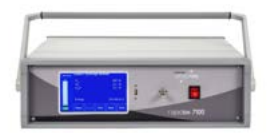
Benchtop - Front and rear

The Rapidox 7100 Green Hydrogen (H2) Analyser is a high specification rack mountable, or bench top instrument designed for the gas analysis, dewpoint measurement and calculation of calorific value for hydrogen produced from the electrolysis of water, suitable either in a research laboratory or on-site.